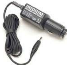
Iridium Cigarette Lighter Adapter (9505A)