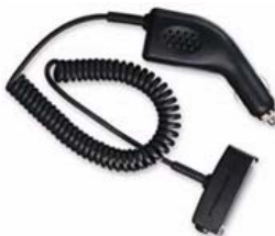
Iridium Cigarette Lighter Adapter (9505)