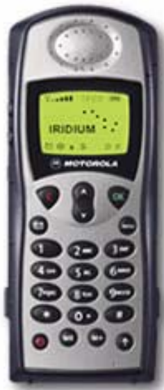
Iridium 9505 / 9505A Satellite Phone

Step 4: Orient solar charger towards sun for optimal charging